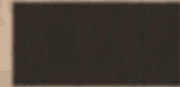
Double-C (24" x 12')