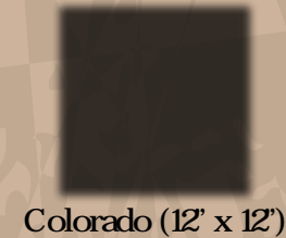
Colorado (12' x 12')

Wood species: Ipe (tabebuia sp.) Finish: pre-finished with protective oil. Plastic base: UV stabilized polyethylene. Packing: 12 tiles per box (6 for Double-C style)