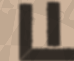
Clip on reducers for outside edges and corners