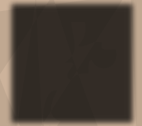
Sierra (12' x 12')