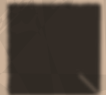
Corner reducers on tile

10 YEAR GUARANTEE: SwiftDeck tiles are fully guaranteed against faulty workmanship for a period of 10 years from the date of purchase. This guarantee however does not cover natural defects in the wood, misuse or if not installed and maintained as per manufacturer's recommendations.